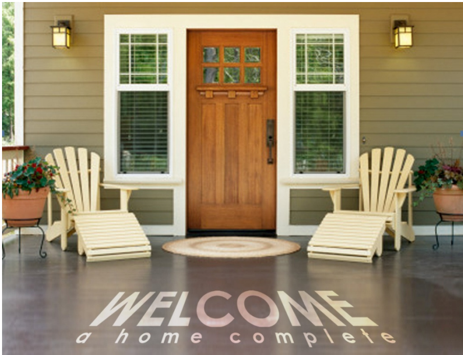
November 16, 2008